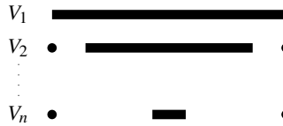
Fig. 3: Sketch of the sets V_1, V_2 and V_n